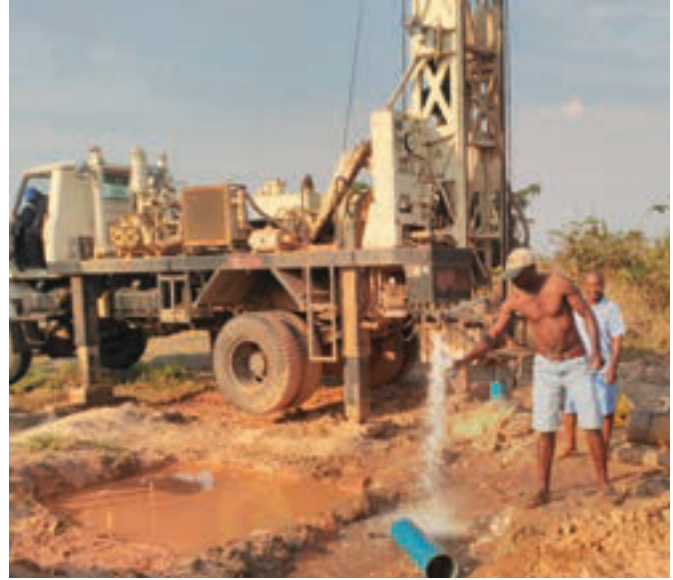
Water-well drilling in Angola (above and below)