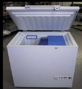
Fig. 2: SolarChill Type A

The SDD vaccine coolers are proving to be more reliable and cost effective than other off-grid vaccine cooler technologies, and solar direct drive vaccine coolers are rapidly becoming the technology of choice of Ministries of Health.