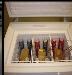
Fig. 3: SolarChill Type B