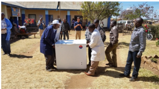
Fig. 4: SolarChill Type A arriving on site in Kenya

In close collaboration with the Ministry of Health of Kenya and the Christian Health Association Kenya (CHAK) more than 35 off-grid health facilities, in 25 counties, were selected for the installation of SolarChill vaccine refrigerators. The different sites will allow for the monitoring of the units under varying climatic conditions.