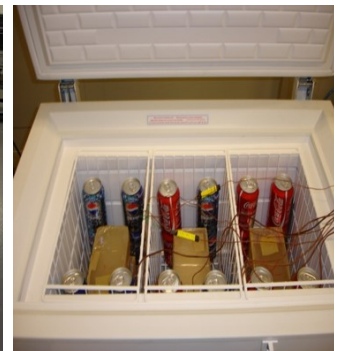
Fig. 3: SolarChill Type B