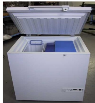
Fig. 2: SolarChill Type A

The SDD vaccine coolers are proving to be more reliable and cost effective than other off-grid vaccine cooler technologies, and solar direct drive vaccine coolers are rapidly becoming the technology of choice of Ministries of Health.